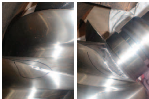
A particularly severely damaged lobed rotor that was repaired and restored back to specification using LaserBond® cladding technology and selected metallurgy.

Rotary screw compressors are simple and efficient machines which are used in a wide range of harsh environments. Efficient operation relies on maintaining close clearances between tips of screws and bearing journals to prevent leakage. Poor air quality accelerates component wear. In many environments, like drilling and mine sites, it is less than ideal which leads to accelerated wear. The normal maintenance solution is to replace the entire compressor rotor module with a new OEM assembly. Sometimes damage can be worse than wear. Using LaserBond's in-house metallographic lab we can match the substrate material to retain integrity of the part.