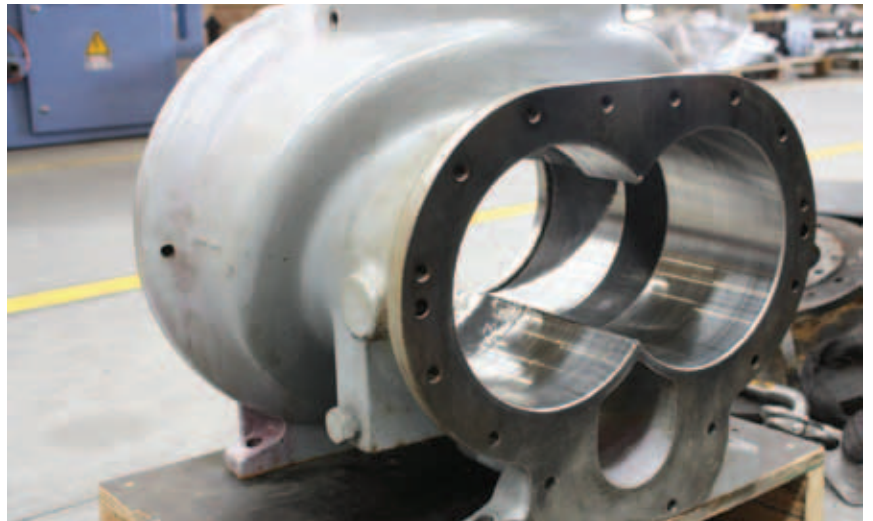
The restoration of the bores in cast iron screw compressor housings using LaserBond's laser cladding process to maintain essential clearances.